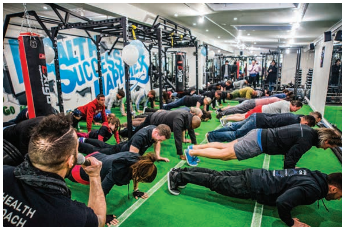
Feat of endurance: The record-breaking push-up session under way at Mighteefit.

This year's East Finchley winter festival will be held on the High Road from 10am to 5pm on Saturday 5 December.